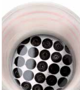
Testing the watertightness on the setting head side under 30 mm water column during 60 minutes