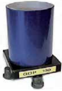
GDP 100 watertightness test bench