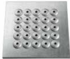
Carrier plate with 25 rivets belonging to the same batch